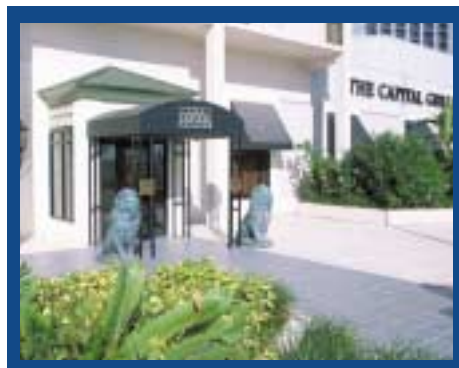
Capital Grille Entrance