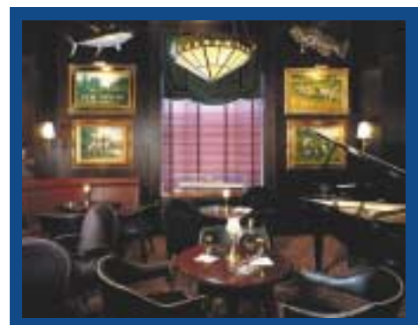
Interior of Capital Grille