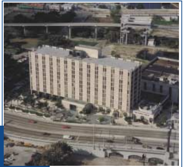
Aerial of Rivergate Plaza