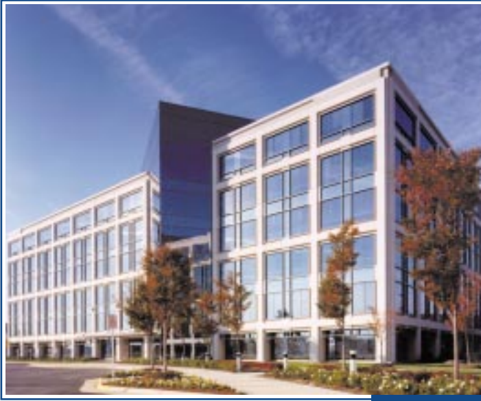
South Pointe I

2350 & 2300 Corporate Park Road Herndon, Virginia 20171