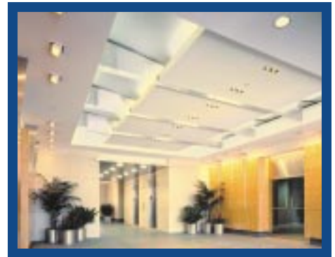
South Pointe II Lobby