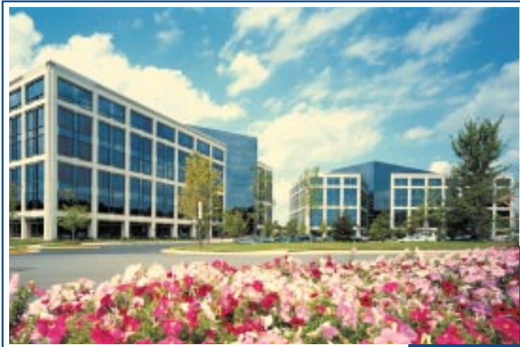
South Pointe I & II

2350 & 2300 Corporate Park Road Herndon, Virginia 20171