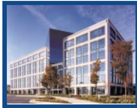
South Pointe II