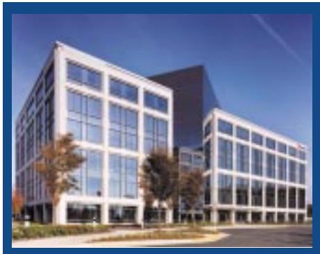
South Pointe II