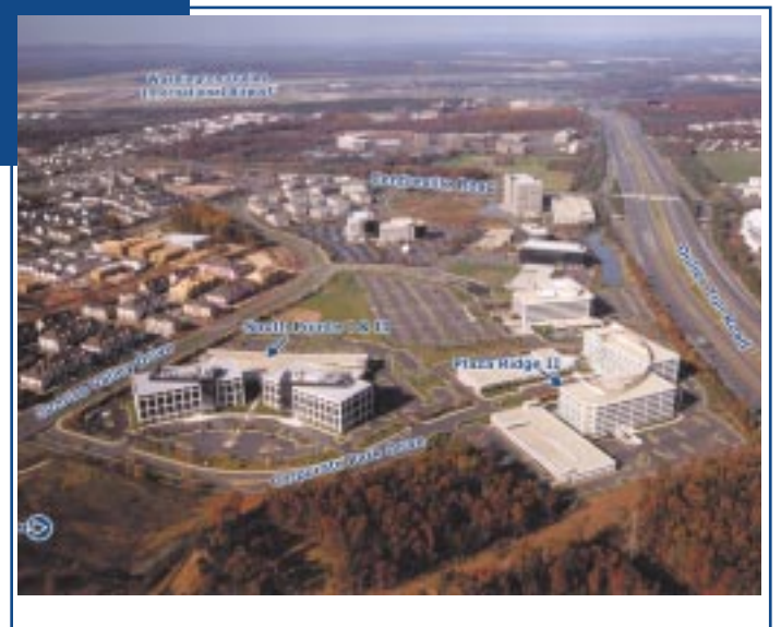
Aerial view of South Pointe I & II