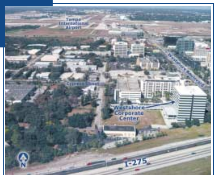
Aerial view of Westshore Corporate Center