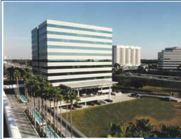
Westshore Corporate Center

600 North Westshore Boulevard Tampa, Florida 33609