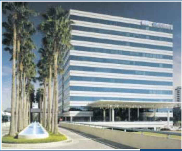
Westshore Corporate Center

600 North Westshore Boulevard Tampa, Florida 33609